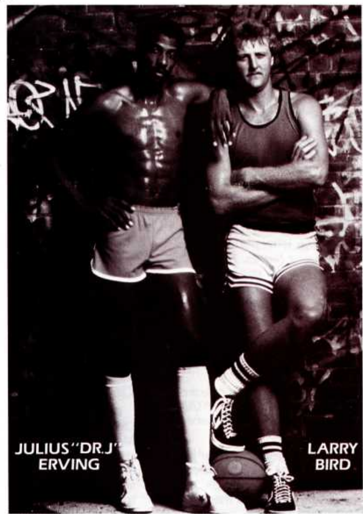
JULIUS "DR. J" ERVING